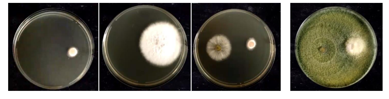
Fusarium Control (1-4 days)